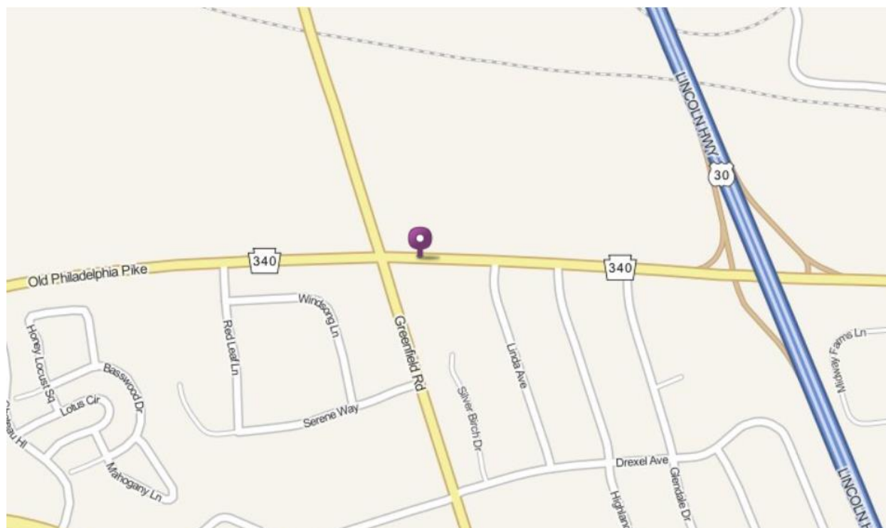
Figure 2: Lancaster Center Location

A statistical breakdown was requested by Central Penn College to East Lampeter Township Police Department for the following locations regarding On-Campus Properties and Public Property: