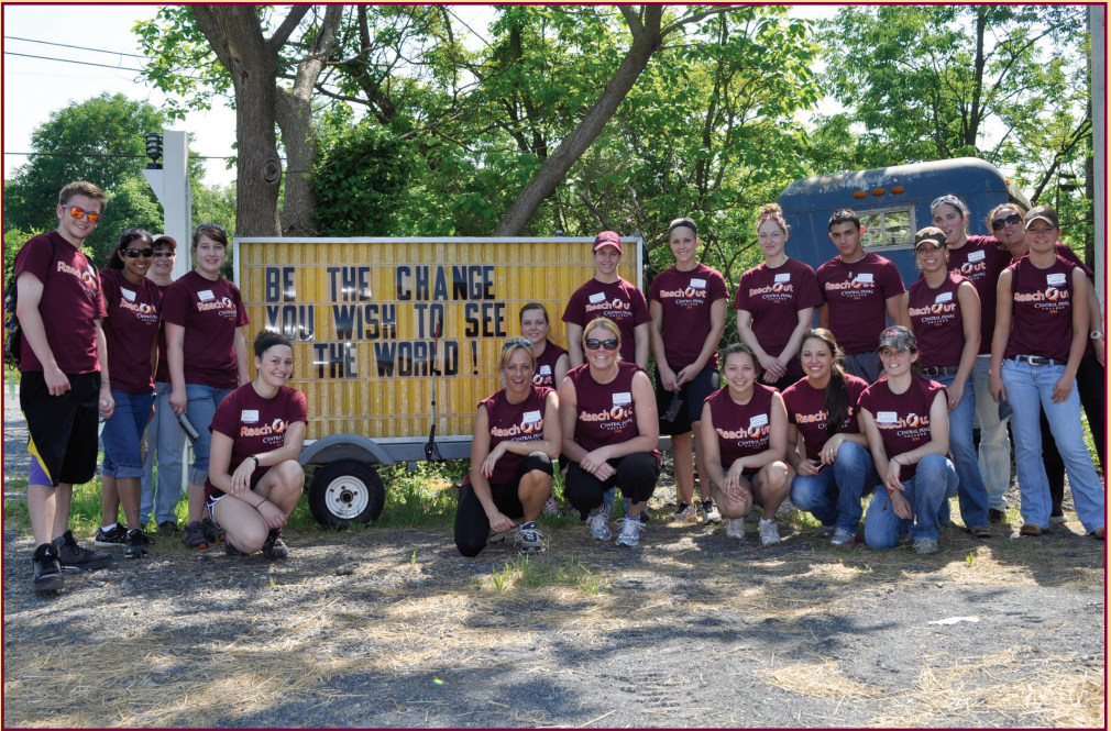
Students volunteer at Capital Area Therapeutic Riding Association during Central Penn's ReachOut Day.