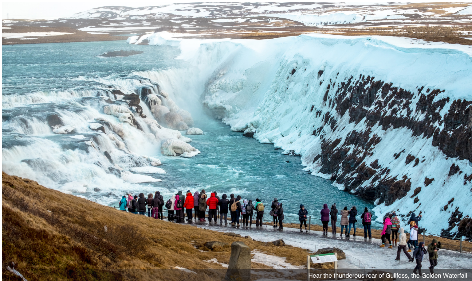
Hear the thunderous roar of Gullfoss, the Golden Waterfall