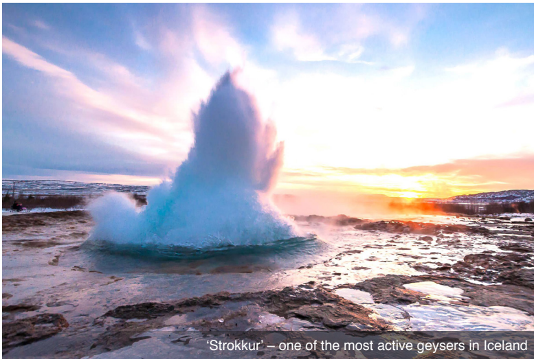
'Strokkur' – one of the most active geysers in Iceland

Enjoy free time for lunch on your own and shopping, then prepare to “take off” as you visit FlyOver Iceland. During this virtual flight, experience waterfalls, geysers, scenic landscapes, and the spectacular natural wonders of Iceland like never before. With the special effects of motion, wind, sound and scents, this unique “flying” experience is sure to be a highlight of your day! Return to the hotel late afternoon for an evening at leisure. Meal: B