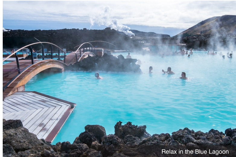
Relax in the Blue Lagoon

DAY 1 Depart the USA: Today you'll depart the USA on your overnight flight to Keflavik, Iceland.