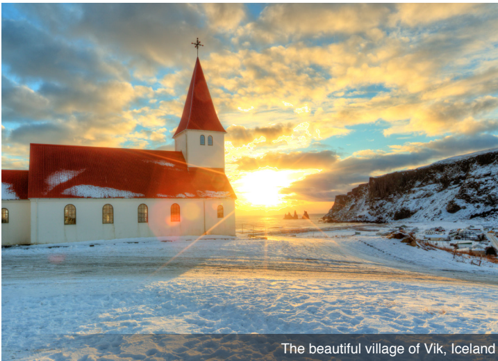
The beautiful village of Vik, Iceland